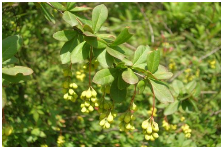
Fig.2 Berberis aristata tree