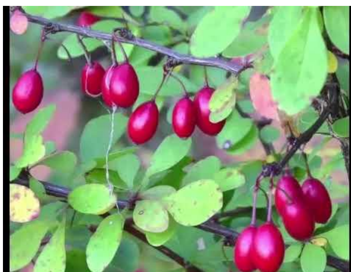
Fig. 1 Berberis aristata fruit